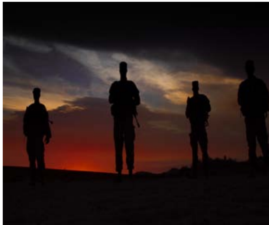
Cavalry Scouts from 2nd Squadron, 11th Armored Cavalry Regiment-Blackhorse, conduct escape and evasion lane training at Ft. Irwin, Calif. May 16.

Follow these steps to point the Viewer to the correct Java program. (Note: administrator privileges are required to perform these steps.) ... Continue reading